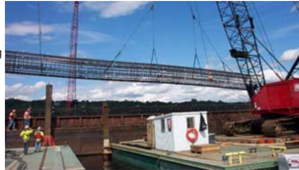
Large tower of rebar being lowered into steel casings

Edward Kraemer & Sons was awarded a $36.73 million contract last spring to construct the foundation for the new crossing and J&L Steel is a subcontractor. The project requires 40 caissons – four per footing, 10 footings, and 10 columns for the five piers. Kraemer's contract will transition to a second general contractor, Lunda/Ames Joint Venture, as the low bidder for the superstructure.