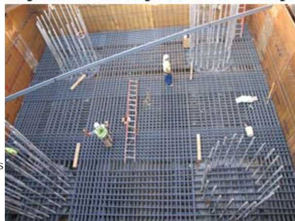
J & L Steel rebar in a cofferdam...rebar as art!

Starting last spring, work crews drilled 40 shafts, also known as caissons, to depths of 140 feet below the water surface. The caissons are lined with 9-foot diameter steel casings. Ironworkers from J&L Steel built and placed rebar cages into the casings. Each casing was later filled with concrete. Cofferdams allowed workers to continue their work from the river bottom to the surface. Additional reinforced steel was used at this stage, too. In late October, the columns started to emerge out of the river, extending to a height of sixteen feet. Lunda/Ames will pick up the project from this point.